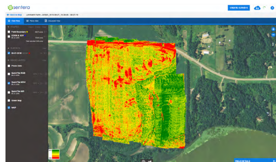
Sentera AgVault desktop software

AgVault™ software unlocks the value of your imagery. Create shapefiles, QuickTile™ maps, organize, store, view, annotate and share images with teams and partners, expanding the circle of impact. You can even fly several DJI drones using your iOS device and AgVault Mobile. AgVault software is compatible with all popular agricultural analytic tools, creating a seamless flow of imagery and data from capture to detailed analysis.