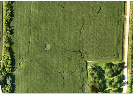
High-Resolution Color Image