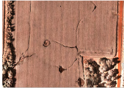
Near-Infrared (NIR) Image